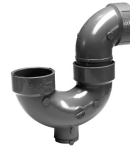
Part No. AW 707XC P-Trap with Solvent Weld Joint & Cleanout (H x H)