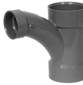
Part No. AW 502C Combination Wye and 1/8 Bend, Reducing (One Piece) (All Hub)