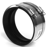
Part No. AW 96C † Transition Coupling - ChemDrain CPVC to Plain-end High-silicon Iron 300 Series Stainless Steel with Fluoroelastomer Gasket