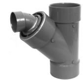
Part No. AW 504C Combination Wye and 1/8 Bend, Reducing (Two Pieces) (All Hub)