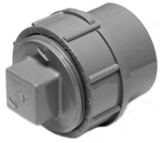
Part No. AW 105XC Fitting Cleanout Adapter with Cleanout Plug (Spigot)