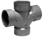
Part No. AW 428C Double Sanitary Tee (All Hub)