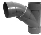
Part No. AW 503C Combination Wye and 1/8 Bend (Two Pieces) (All Hub)