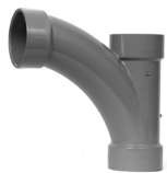
Part No. AW 501C Combination Wye and 1/8 Bend (One Piece) (All Hub)