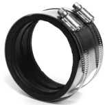
Part No. AW 95C † Transition Coupling - ChemDrain CPVC to Steel, Cast Iron, Plain-end Glass or Any Other Schedule 40 or 80 IPS Size Plastic or Metallic Pipe 300 Series Stainless Steel with Fluoroelastomer Gasket