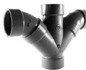
Part No. AW 507C Double Combination Wye and 1/8 Bend (Three Pieces) (All Hub)