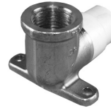
Part No. CTS 2302 L Low-Lead Brass Drop Ear Elbow (FPT x CTS SOCKET)

All products manufactured by Charlotte Pipe and Foundry Company are proudly made in the U.S.A.