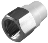
Part No. CTS 2105 L Low-Lead Female Adapter, Brass Threads (BRASS FPT x CTS SOCKET)

Note: Different discount may apply to brass items. Please contact sales office.