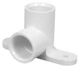
Part No. CTS 2300 D Drop Ear Elbow (ALL-CPVC SOCKET x SOCKET)