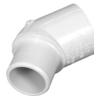
Part No. CTS 2310 Street Elbow 45° (SPG x S)