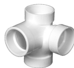
Part No. PVC 449 Sanitary Tee with 2" Left Hand Sanitary Inlet on Center (ALL HUB)