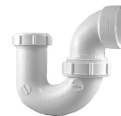
Part No. PVC 711 W L.A. Pattern P-Trap with PVC Nut Furnished with a 1½" PVC nut, a 1½" washer and a 1½" x 1¼" washer (SLIP with Union x H)