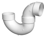
Part No. PVC 706 X P-Trap (H x H)