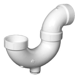
Part No. PVC 707 X P-Trap with Cleanout (H x H)