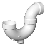
Part No. PVC 707 X P-Trap with Cleanout (H x H)