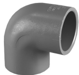
Part No. PVC 8300 90 Degree Elbow [SxS]