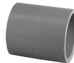
Part No. PVC 8100 Coupling [SxS]