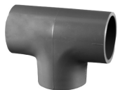
Part No. PVC 8400 Tee [SxSxS]