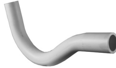
Part No. PVC 2700 Condensate P Trap (SPG x SPG)