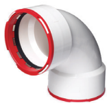
Part No. CTT 300 ConnectTite 1/4 Bend (Hub x Hub)