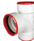
Part No. CTT 400 ConnectTite Sanitary Tee (All Hub)