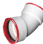
Part No. CTT 321 ConnectTite 1/8 Bend (Hub x Hub)