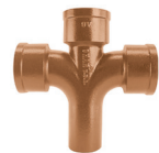
Part No. HP SV 109 Edge HP Sanitary Cross