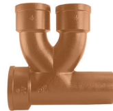
Part No. HP SV 72 Edge HP Double Two-Way Cleanout