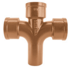
Part No. HP SV 109 Edge HP Sanitary Cross