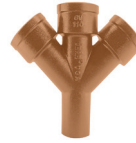
Part No. HP SV 110 Edge HP Double Wye