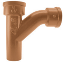
Part No. HP SV 33 Edge HP Combination Wye and Eighth Bend (Long Turn Pattern)