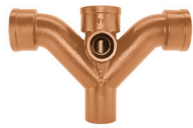
Part No. SV 35 F Edge HP Double Combination Wye and Eighth Bend (Long Turn Pattern)