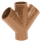
Part No. HP NH 21 Edge HP Double Wye