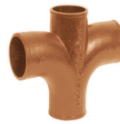
Part No. HP NH 30 Edge HP Sanitary Cross