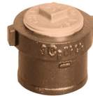
Part No. HP NH 52 S Edge HP Tapped Ferrule with Southern Raised-Head Brass Plug Installed